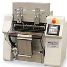
Auto Bag R1075 Automatic Bagger