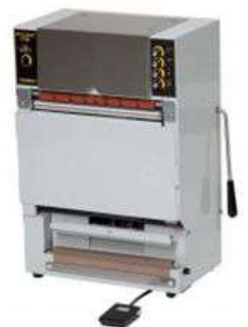
Auto Bag 575B Fulfillment Bagger