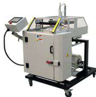
Auto Bag Magnum Horizontal Automatic Bagger