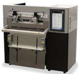
Auto Bag R785 Automatic Bagger