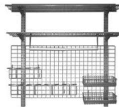
Wall Shelving Sink Kit