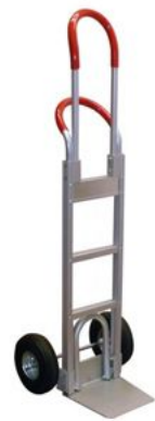
Mule Hand Truck