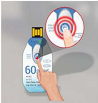
1. Press button to start