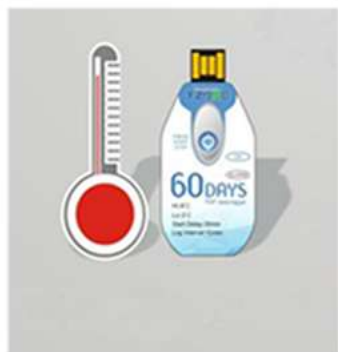
3. Log temperature