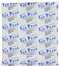
Ice Peak Ice Gel Pack