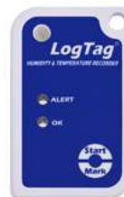
HAXO - 8