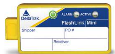
FlashLink® Mini In-Transit Logger