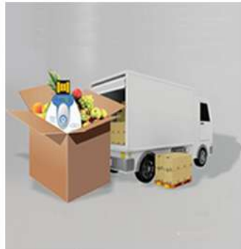
2. Pack into shipment