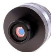
High Voltage Motor Protection Unit