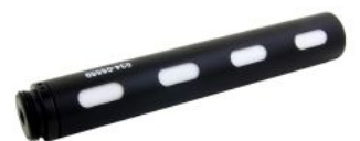
Hydrocarbon Adsorption Unit