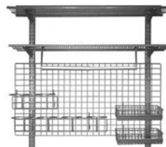
Wall Shelving Sink Kit