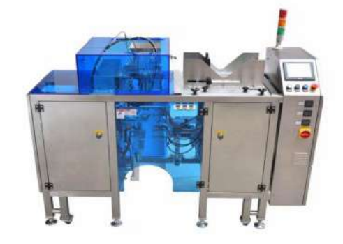
Linear Compact Premade Pouch Machine