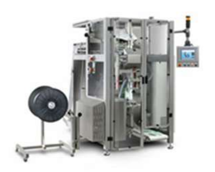
Doy-Pack Packing Machine