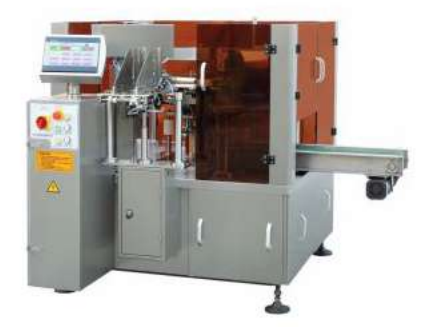
Rotary Compact Premade Pouch Machine