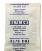
Humi Dri Sachet