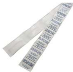
Humi Dri Spool