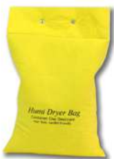
Humi Dryer Bag