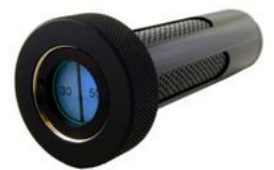
Metal Panel Mounting Desiccators