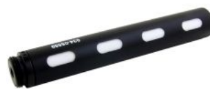
Hydrocarbon Adsorption Unit