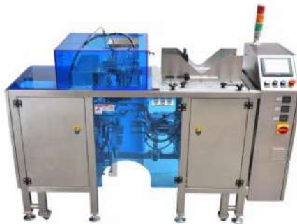
Linear Compact Premade Pouch Machine