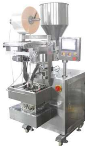
VFH6-3S-G320 3 Side Seal VFFS Bagger (PLC)