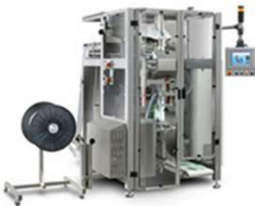
Doy-Pack Packing Machine