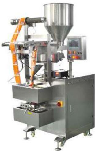
VFH6-4S-G320 4 Side Seal VFFS Bagger (PLC)