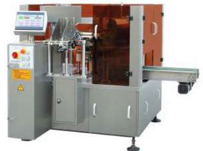
Rotary Compact Premade Pouch Machine