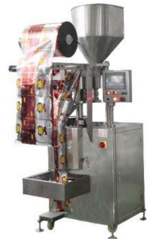
VFH6-G420 Pillow Bag VFFS Bagger (PLC)