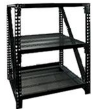
Beer Cave Shelving