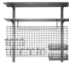
Wall Shelving Sink Kit