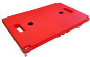
Jumbo - Mule Dolly