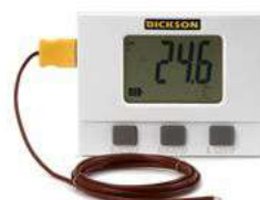
Display Temp Data Logger