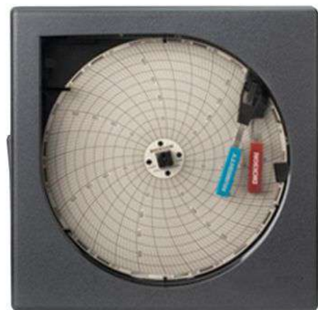
6 inches (152mm)