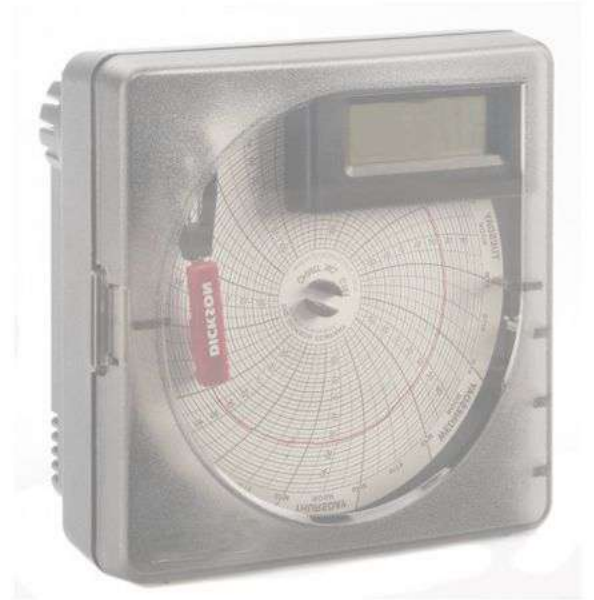
Chart refills available in two sizes