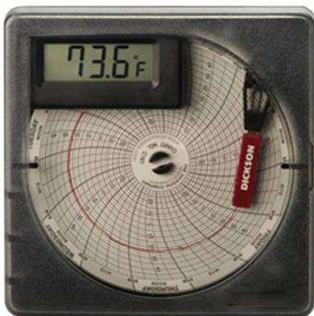
4 inches (101mm)