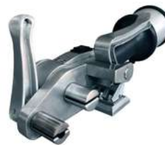
Battery Operated Tensioner