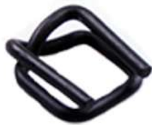
Nitrated Wire Buckle